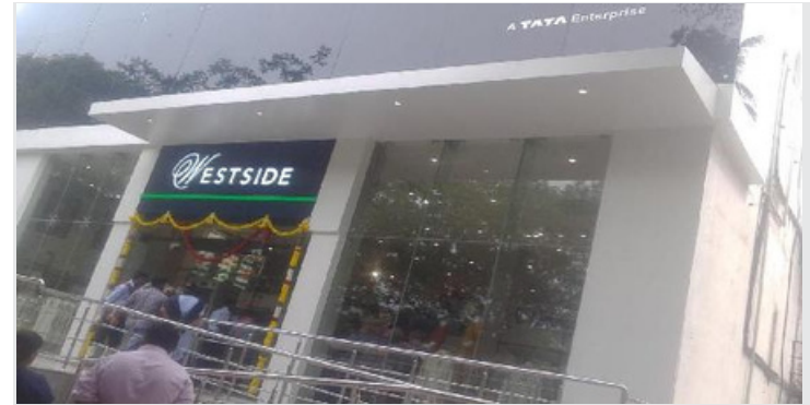
WESTSIDE - CHENNAI