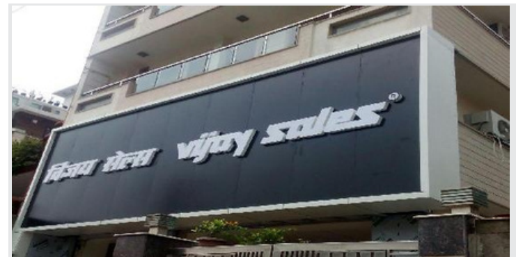
ACP :- 2000 sq ft.