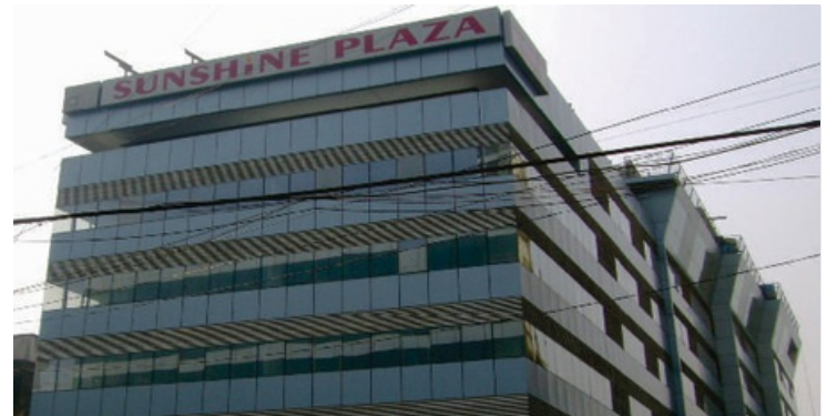
SUNSHINE PLAZA - DADAR

GLAZING :- 8000 sq ft. ACP :- 2000 sq ft.