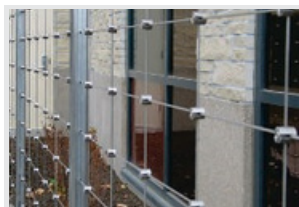
S.S. Trellis System