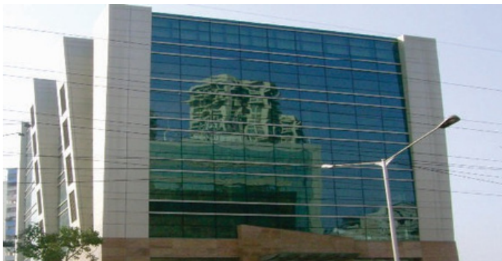
WESCON - ANDHERI

GLAZING :- 20000 sq ft. ACP :- 19000 sq ft.