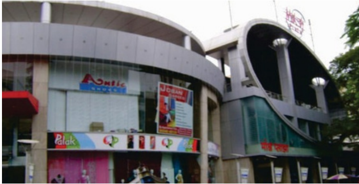
MOKSHA PLAZA - BORIVALI

GLAZING :- 20000 sq ft. ACP :- 16000 sq ft.