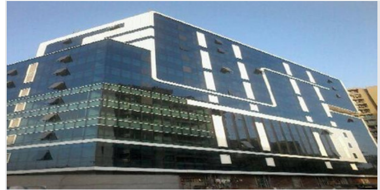
GLAZING :- 40000 sq ft. ACP :- 20000 sq ft.