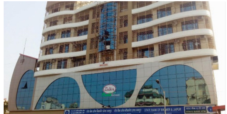
ZAIKA BANQUET HALL

GLAZING :- 23000 sq ft. ACP :- 15000 sq ft.