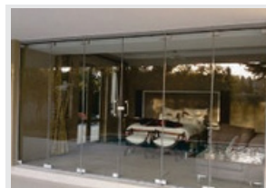
Frameless Sliding Doors