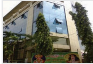
Shriram Trade Centre