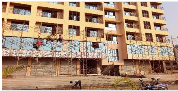
LAXMI COMPLEX - VIRAR