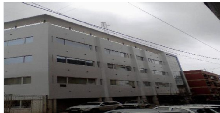
TIMBLO INDUSTRIES - GOA