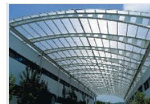
Polycarbonate Sheet Roofing