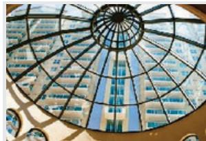
Sky Light & Domes