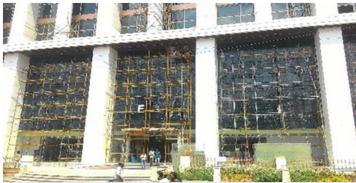
WESTSIDE - BANGALORE