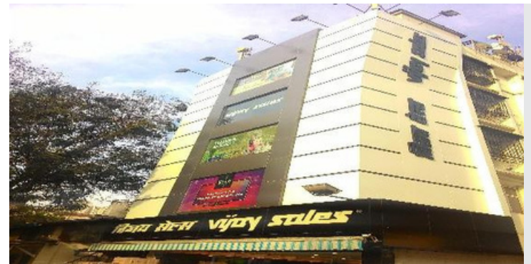
GLAZING :- 1000 sq ft. ACP :- 5000 sq ft.