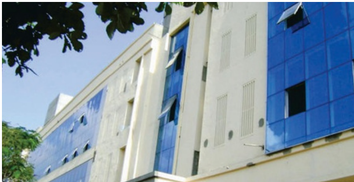
MODEL TOWN - KANJURMARG

GLAZING :- 5000 sq ft. ACP :- 8000 sq ft.