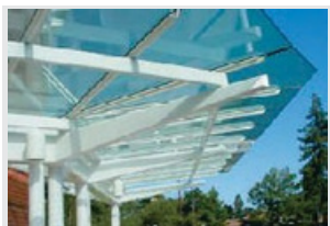
ACP & Glass Canopies