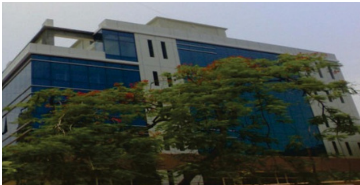
VERTEX VIKASH - ANDHERI

GLAZING :- 12000 sq ft. ACP :- 6000 sq ft.