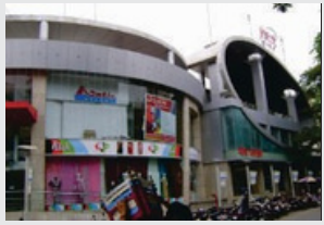
Moksha Plaza - Borivali