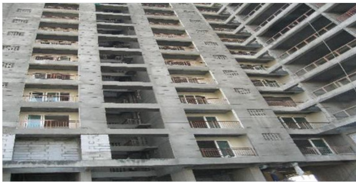
NAHAR & SETH-MULUND