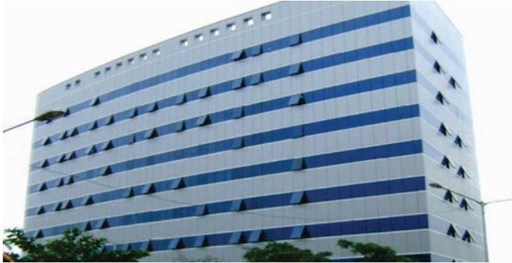
BANK OF BARODA - BKC

GLAZING :- 350000 sq ft. ACP :- 40000 sq ft.