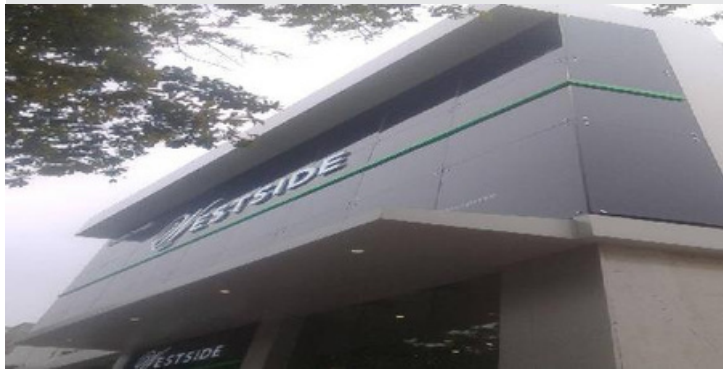
WESTSIDE - CHENNAI SPIDER GLAZING :-2000 sq ft ACP :- 2200 sq f