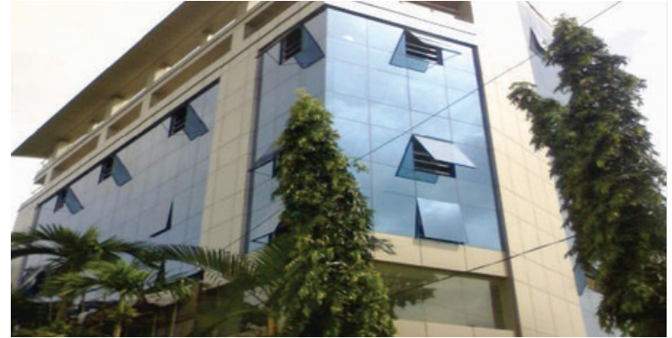
SHRIRAM TRADE CENTRE

GLAZING :- 20000 sq ft. ACP :- 16000 sq ft.