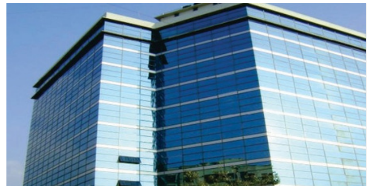
URMI CORPORATE PARK - POWAI

GLAZING :- 33000 sq ft. ACP :- 11000 sq ft.