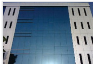
Vertex Vikas - Andheri