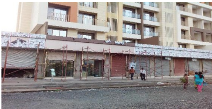
Shatrunjay Heights - BHAYANDER