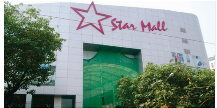
STAR MALL - ANDHERI

GLAZING :- 33000 sq ft. ACP :- 10000 sq ft.