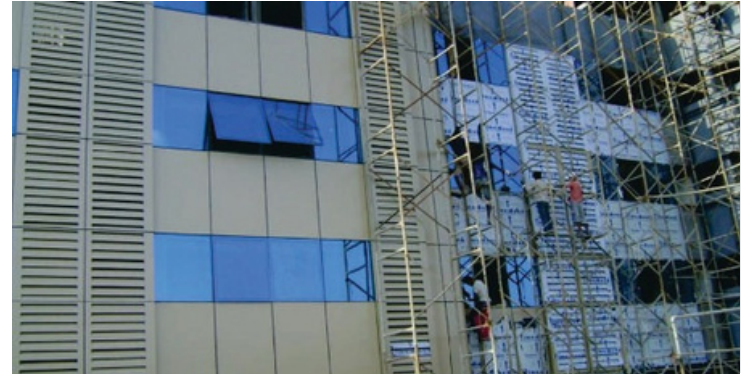
SHREE SHAMARTH PLAZA - MULUND

GLAZING :- 350000 sq ft. ACP :- 40000 sq ft.