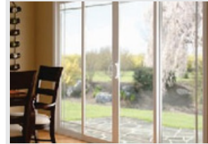
Sliding Windows & Doors