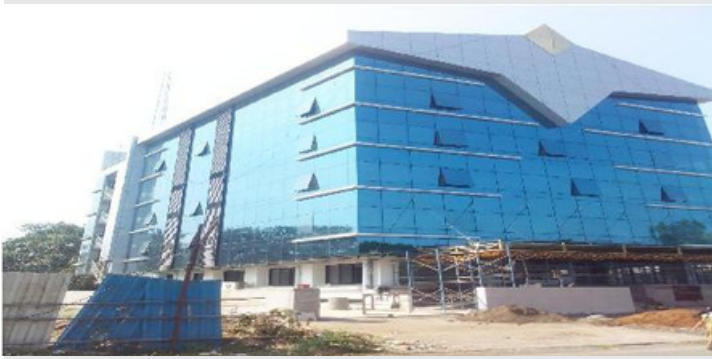
VASAI VIKAS BANK - VASAI GLAZING :- 18000 sq ft. ACP :- 10000 sq ft. ASHOKA SMRUTI - ANDHERI